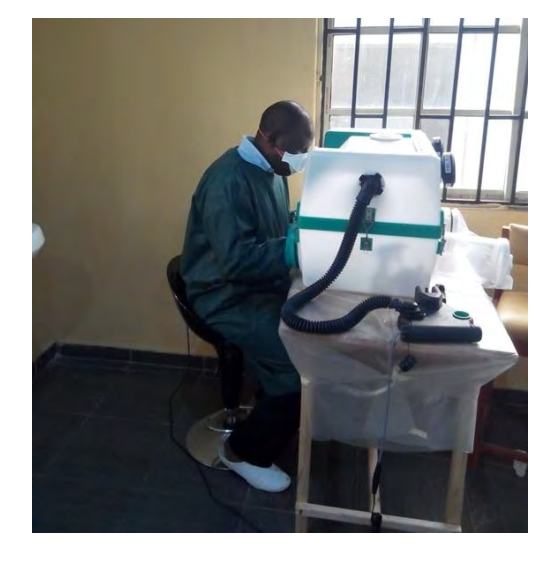
A PhD candidate at the Institute of Human Virology-Nigeria, a

The disease has spread throughout the country, and in just the first three months of 2018 the Nigerian Center for Disease Control (NCDC) had reported 1,613 confirmed cases and 134 deaths. In all of 2016 there were only 79 reported cases of Lassa fever and 35 deaths, and a little more than that in 2017.