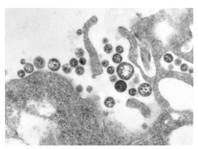
Lassa Fever Virus

in the science of such viruses, have partnered with the World Health Organization (WHO), the Nigerian Center for Disease Control (NCDC) and the Coalition for Epidemic Preparedness Innovations (CEPI) to support fieldwork, surveillance, laboratory diagnostics, contact tracing and prevention education. Using its network of experts and laboratories, GVN has helped to validate simple rapid tests that are being used at rural clinics in villages and to support research to understand transmission patterns and find an effective vaccine.