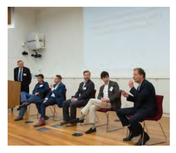
Dr. Robert Gallo leads a panel discussion on the status of HTLV-1 research during the 9th International GVN Meeting in Melbourne.

had a much lower profile internationally than other viruses and it has tragically often been seen as a harmless virus."