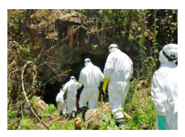
The team in Zambia research bats from a cave.

The partnership allows for the pooling of expertise in different areas in veterinary, clinical and basic research. Together, ACEIDHA, HU and UCD have developed programs to identify new, emerging and re-emerging viruses. These research activities include mosquito collection and analysis by conventional polymerase chain reaction and next-generation sequencing as well as classical virus isolation and characterization. In addition, HU has close ties with the Japanese pharmaceutical industry,